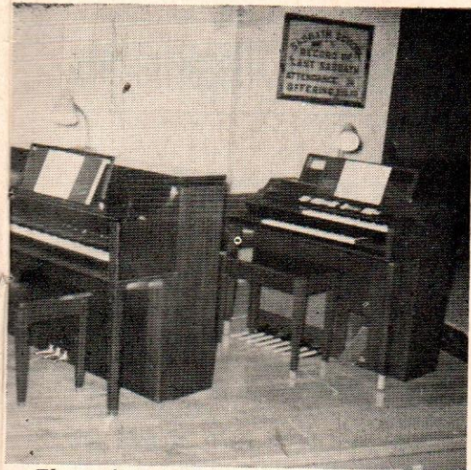
The spinet piano and electric organ

property is now worth about twice the original cost to the brethren, and the debt has all been paid.