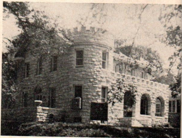
The Kansas City church building

The church is at a very good location two blocks west of Broadway at the intersection of 36th Street and Pennsylvania Avenue (at the edge of the Valentine shopping center). The